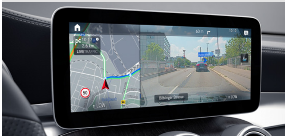
Augmented reality navigation