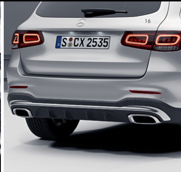
AMG diffuser-look rear apron with insert in black