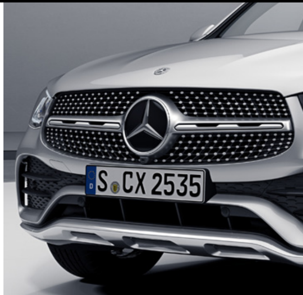
AMG front apron with sporty air intakes and chrome trim element