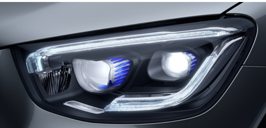
MULTIBEAM LED headlamps