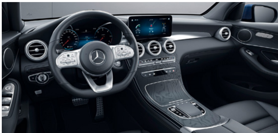
Open-pore black ash wood trim