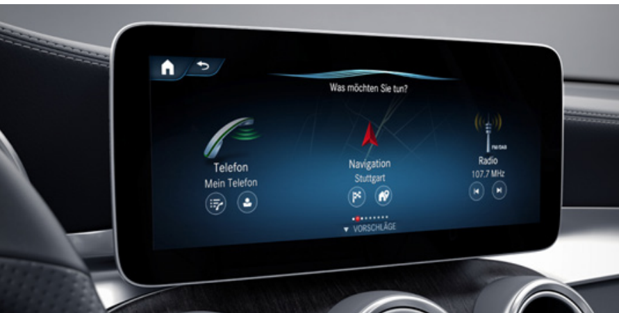
Intelligent voice control lets you control many functions, including destination input