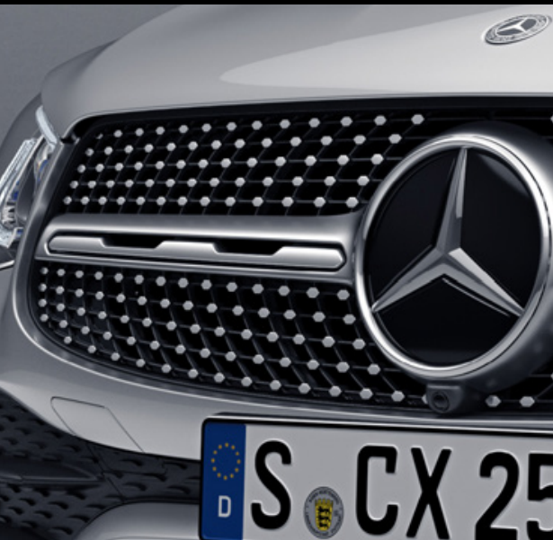
Diamond radiator grille