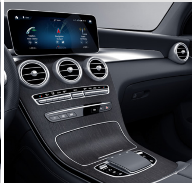
Grey open-pore oak trim