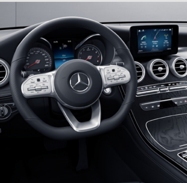
Flat-bottomed steering wheel with touch control buttons