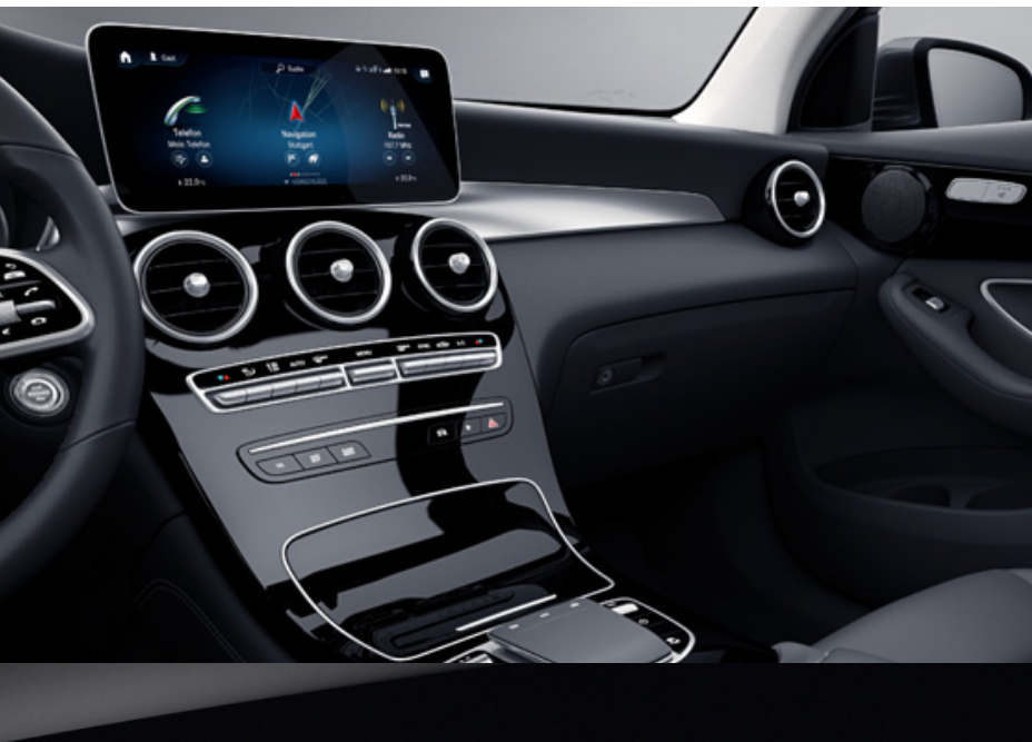
H80 high-gloss black