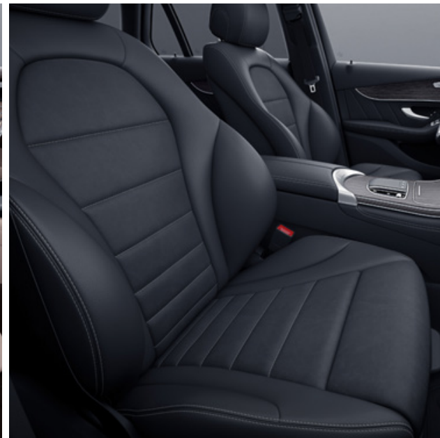
651A ARTICO man-made leather/DINAMICA microfibre – black