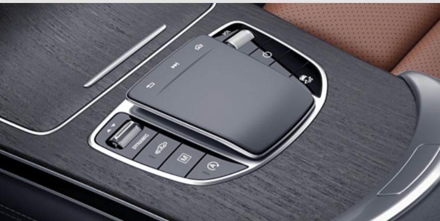
Multi-gesture touchpad control

Introducing MBUX, the new Mercedes-Benz User Experience infotainment system that can be controlled via voice and touch input. The new GLC models feature this innovative way of communicating with your Mercedes-Benz. Standard across all model lines.