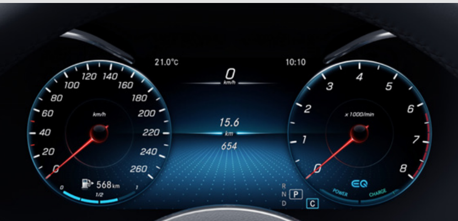
12.3-inch digital instrument cluster