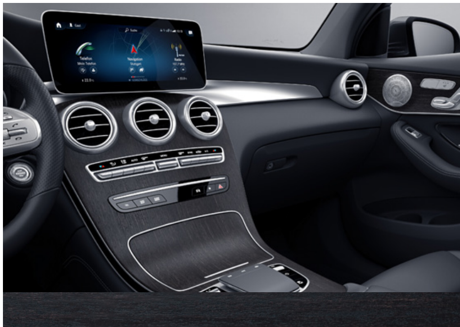
H31 grey open-pore oak wood