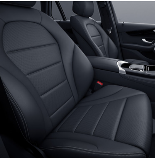
101A ARTICO man-made leather – black