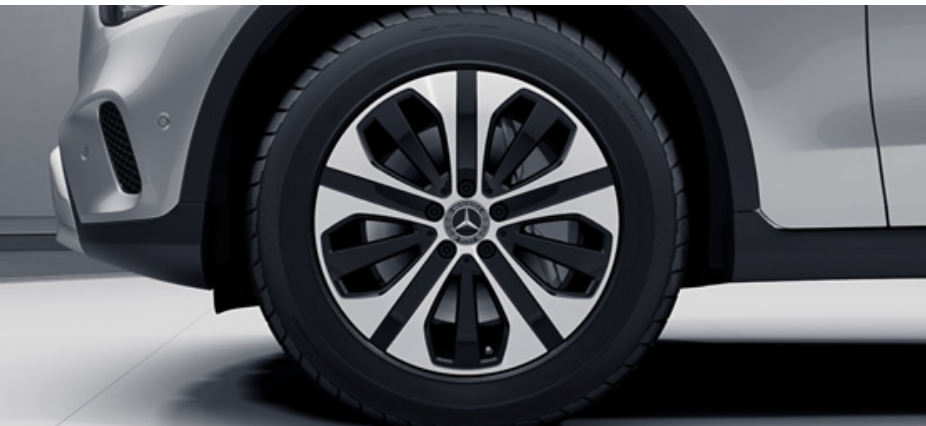
64R 18" alloy wheels (4) – 5-triple-spoke design, painted high-gloss black with a high-shine finish front and rear: 235/60 tyres with TIREFIT