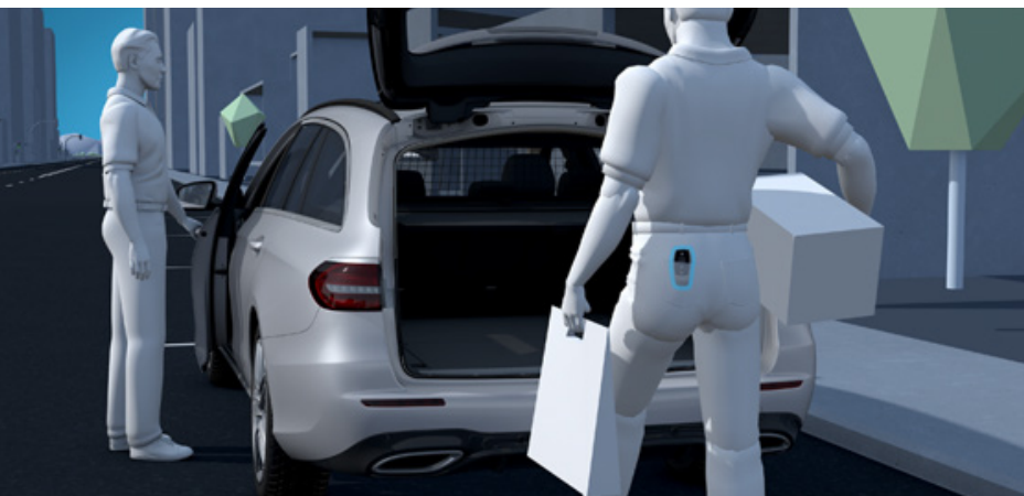
KEYLESS-GO Comfort package