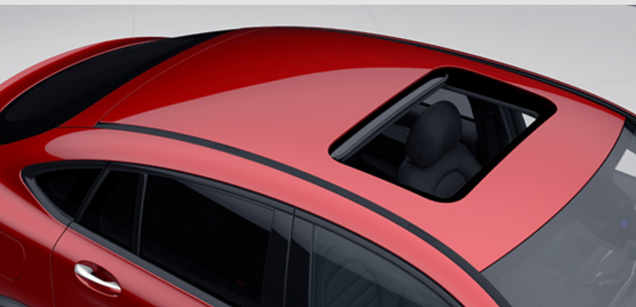
Sliding sunroof (Coupé)