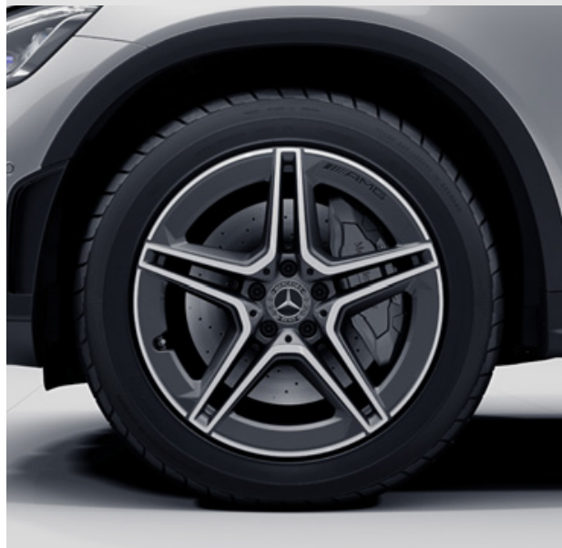
19" AMG 5-twin-spoke alloy wheels