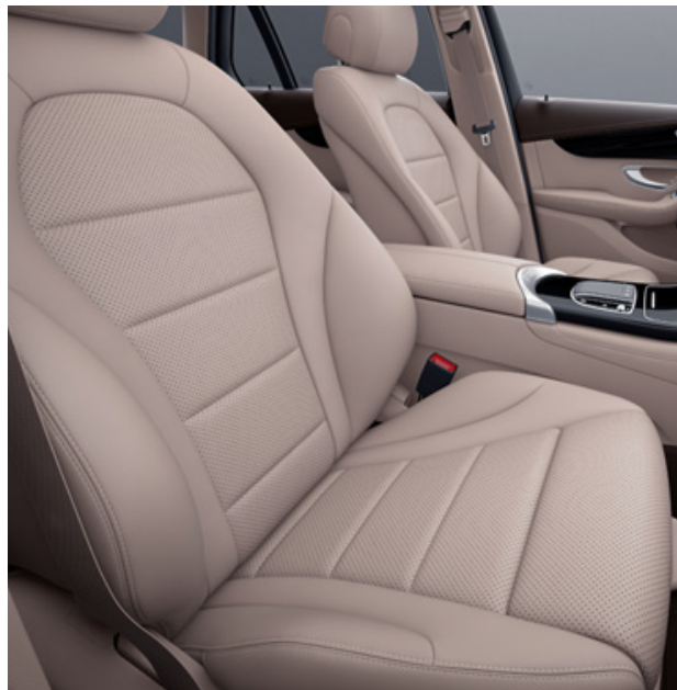
115A ARTICO man-made leather – silk beige