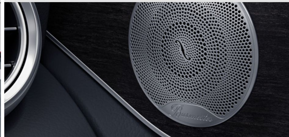
Burmester® surround sound system