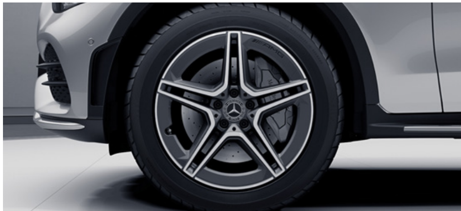
RTF 19" AMG alloy wheels (4) – 5-twin-spoke design, painted tremolite grey with a high-shine finish front and rear: 235/55 tyres with TIREFIT